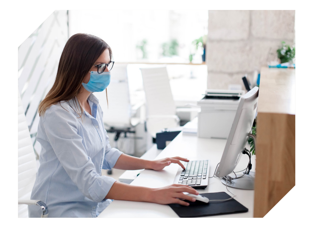
See Increase Focus on Care Management on page 8.